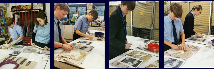
Yr 9 creating Maggi Hambling inspired relief artworks