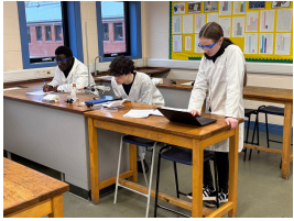
Year 13 Chemists